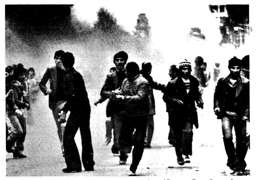
Demonstrators in Tehran flee through city streets when soldiers open fire on the crowds;

According to a report by the Rand Corporation there have been 42 terrorist assaults on diplomatic missions since 1971, with almost half of them having taken place within the past two years.