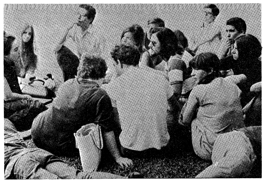
Hippies in Herman Park in Houston listen in rapt attention to a message on Jesus Christ.

We might comment - Why not? Surely young people can see through the camouflage of modern morality that it is just plain "immorality" that leaves only heartache and headache. ruined bodies and damned souls. It's inspiring to know there are those boldly testifying for Jesus Christ who have come to know Him as Saviour and Lord.