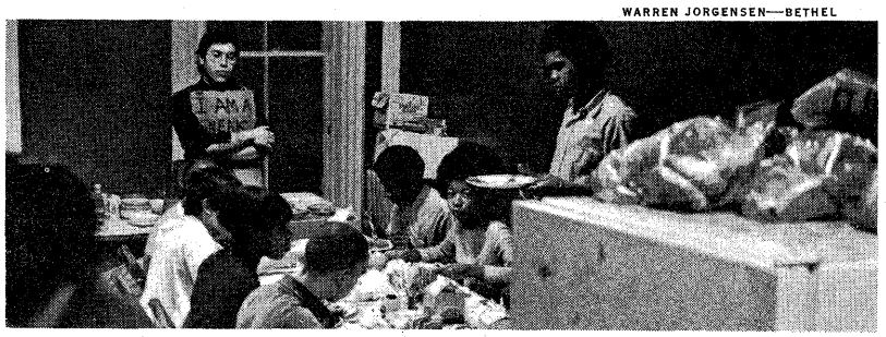
YOUTHFUL DRUG ADDICTS

The increase in the use of drugs, in particular, are largely responsible for the hippie-type behaviour, the