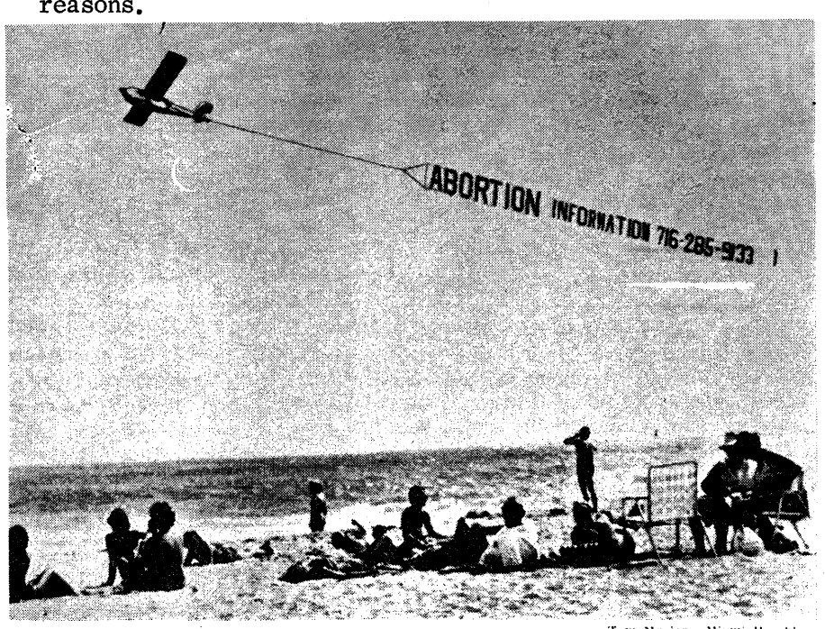
Abortion pro and con: An airborne ad Newsweck