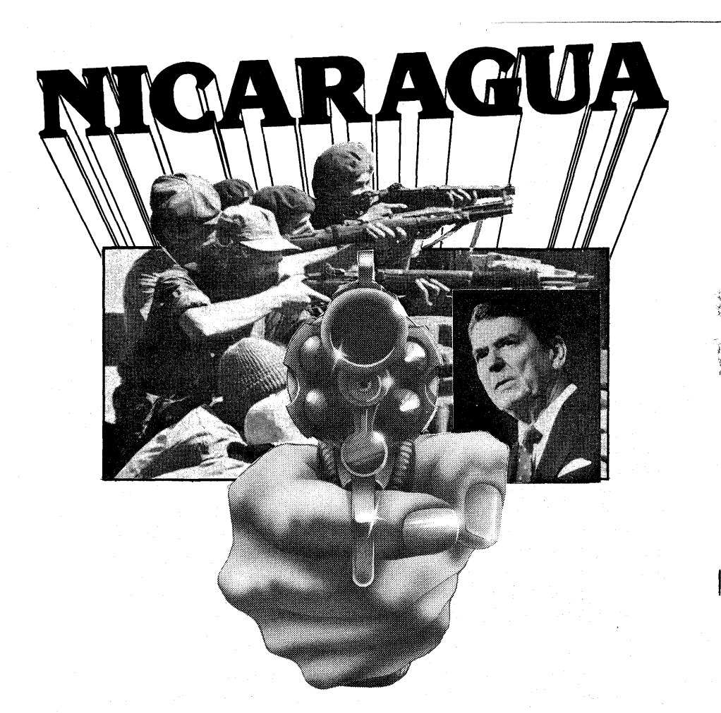
THE STRUGGLE FOR FREEDOM CONTINUES

U.S. NEWS & WORLD REPORT, in an editorial by David Gergen, discusses U.S. administration policy over Nicaragua.