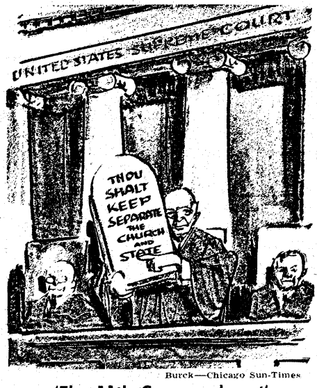
'The 11th Commandment'

For remember he hath said: "Be ye therefore ready, for in such an hour as ye think not, the son of man cometh!"